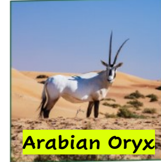
UAE endangered animals