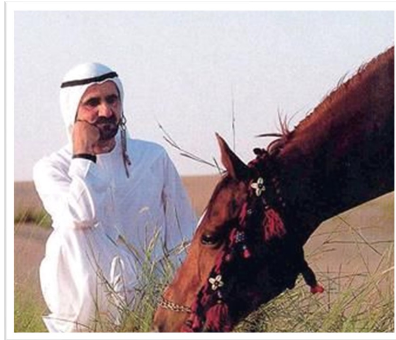
His Highness Sheikh Mohammed bin Rashid Al Maktoum