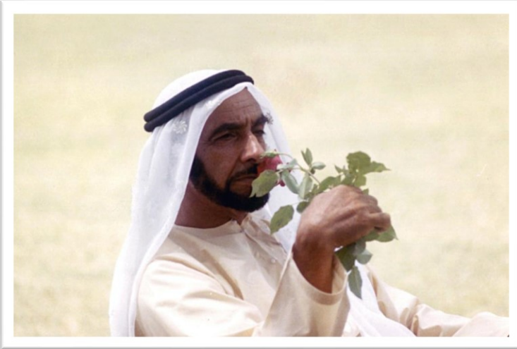
Sheikh Zayed bin Sultan Al Nahyan (Peace be Upon His Soul)

Read excerpts of Emirati poems and look for nature references.