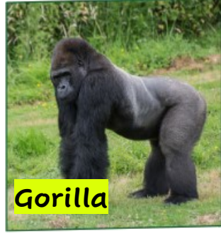
Global endangered animals