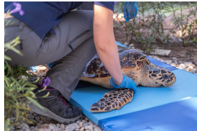
Turtle Rehabilitation Project