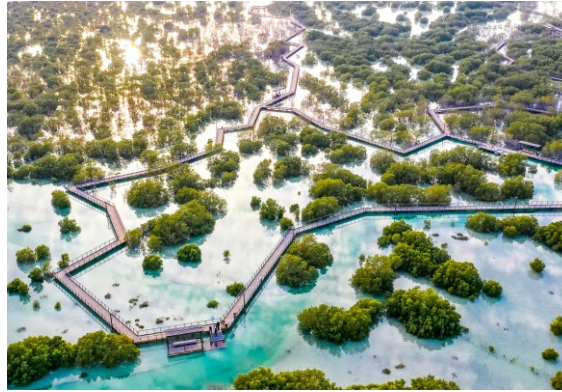
Jubail Mangroves Park

Climate resilient means becoming better at dealing with the impacts of climate change