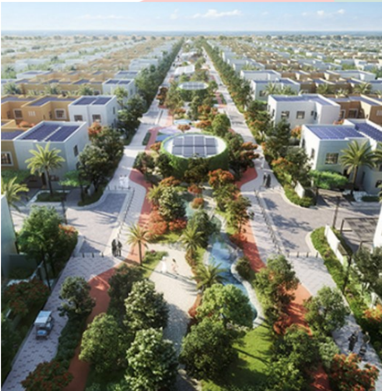
Sharjah Sustainable City

Research, explore and learn about sustainable cities.